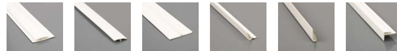
H-Section Division bar H-Section Division cap H-Section Division base C-Profile Internal corner J-Section Starter trim F-Section External corner

Brett Martin has a range of accessories available, colour matched to Brett Martin's white material. The accessories are anti-microbial, so suitable for use with all the products in the Marvec Cladding range.